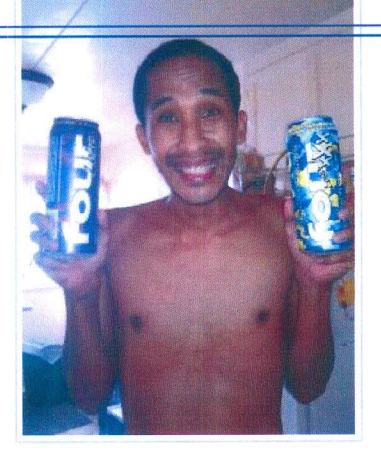
Like · Comment · October 1 at 10:16pm ·