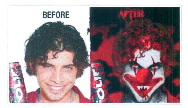
Down for getting Creepy Clowned this Halloween?

We'll be posting the first reveal tomorrow!