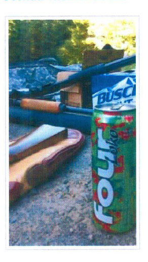
Like · Comment · October 1 at 8:53pm ·