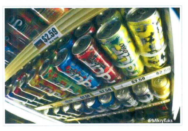
Like · Comment · October 2 at 11:19pm ·