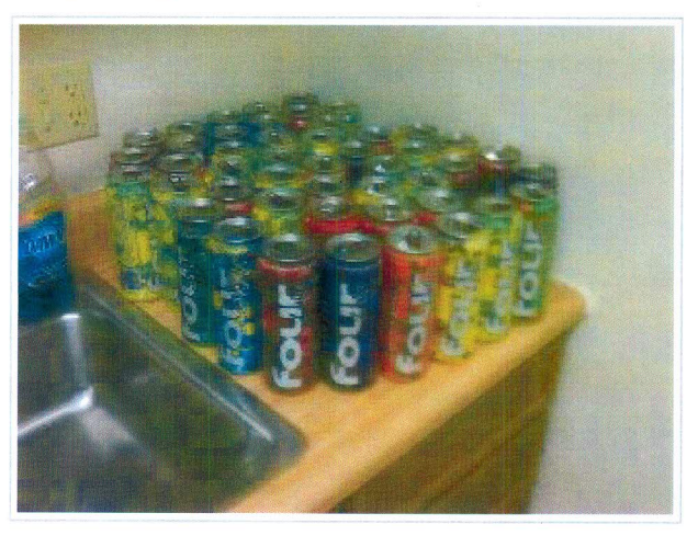
Like · Comment · Thursday at 9:01pm ·